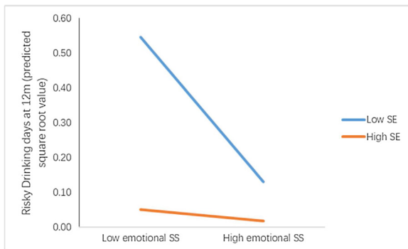
Fig. 2. Interaction between self-efficacy and emotional support provision on risky drinking days at 12 months. SS = social support. SE = self-efficacy.

Note. For illustration purposes, this plots represent the predicted means of the square root of risky drinking days at 12 months for four subgroups: (1) low informational support expression/low self-efficacy; (2) low informational support expression/high self-efficacy; (3) high informational support expression/low self-efficacy; and (4) high informational support expression/high self-efficacy. We used median splits for categorizing informational support expression and self-efficacy.